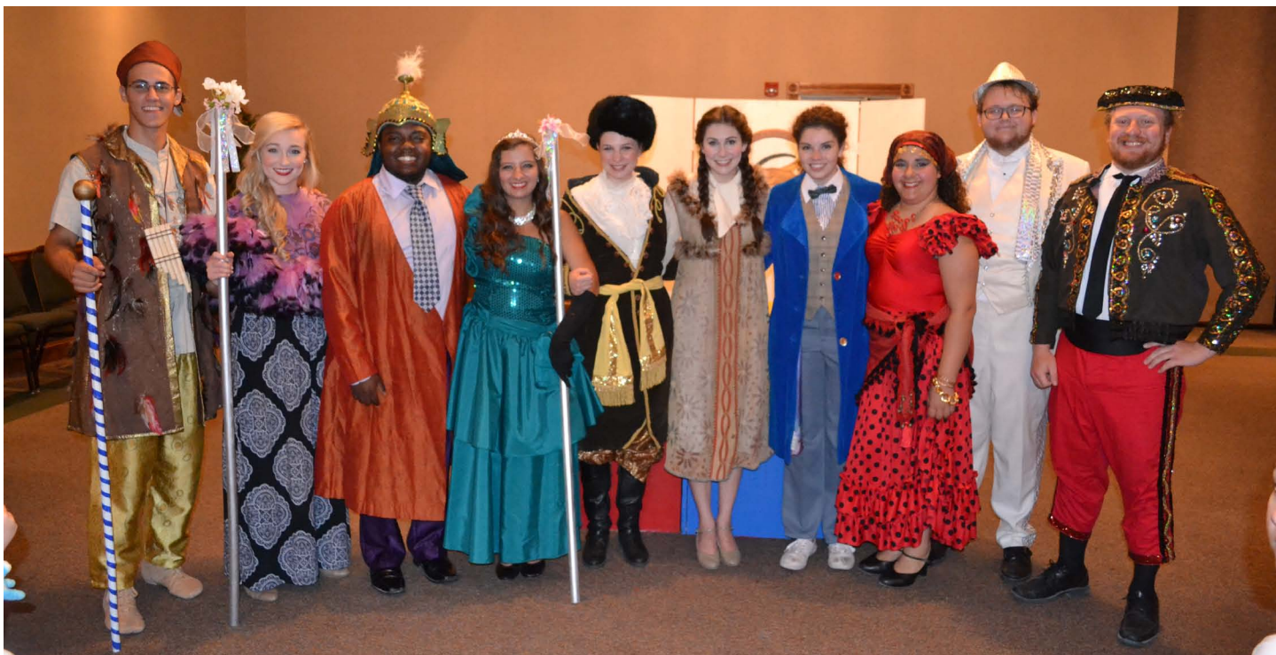
The cast of "Opera Games," this year's children's opera, poses after their performance at Federation Days July 17. The show was presented to children throughout northwest Arkansas.