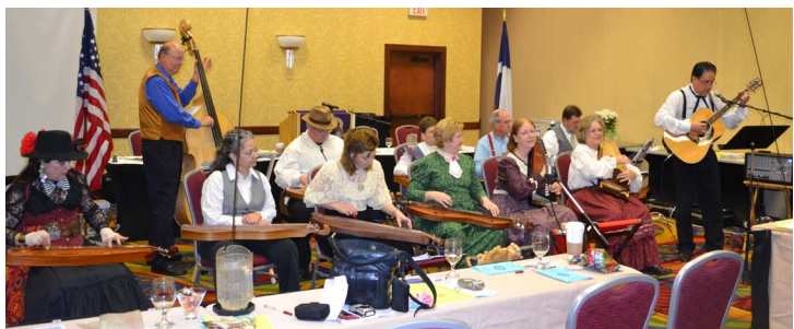
The Bay Area Dulcimer and Strings Society gave a musical interlude at the Houston convention.