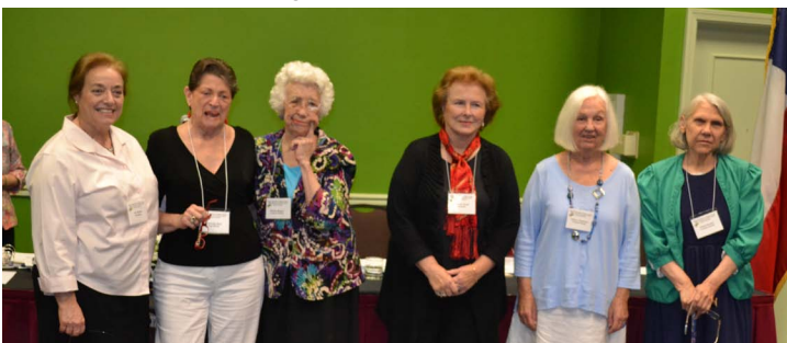
First-time attendees at the TFMC convention are recognized at the beginning of the meeting.